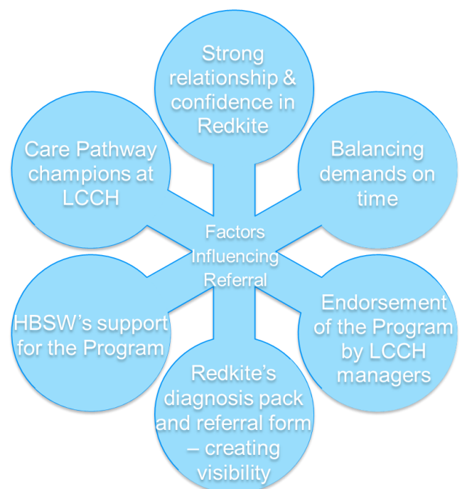
Figure 3. Factors influencing endorsed referral numbers to Redkite Community Based Support.

Figure 3 illustrates the numerous factors which impacted on referral from LCCH to Redkite CBS.